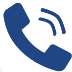
Telephone/ Cell Phone