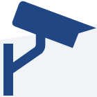
Front Door Monitor