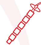
Sip and Puff