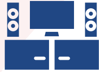
TV / Home Theater